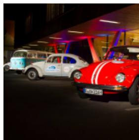
Echte Berliner Jungs © GmbH