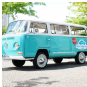
Echte Berliner Jungs © GmbH