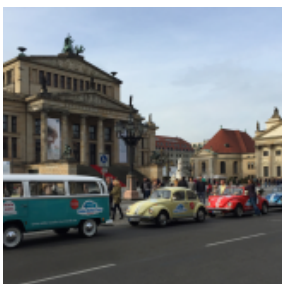
Echte Berliner Jungs © GmbH