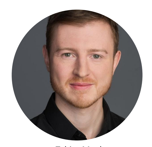
Tobias Maul Press Office | Congress PR