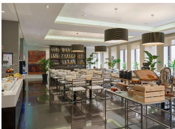
Restaurant „Salt & Pepper“

Our restaurant “Salt & Pepper” with a mix of delicate Mediterranean and international food, our bar at the lobby, our business center and an underground garage complete our offer. Our charming typical Berlin terrace is perfectly suited for smaller events.