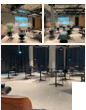
Parliamentary seating arrangement with tables: 60 people + 2 speakers