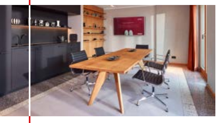
Vitra Lounge24 m²Table seating: 8 people