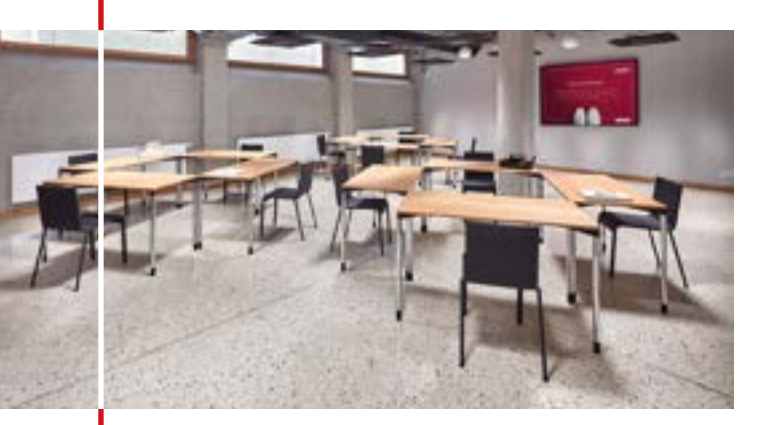
Meeting room B1 65 m<sup>2</sup> Parliamentary seating arrangement: 26 people