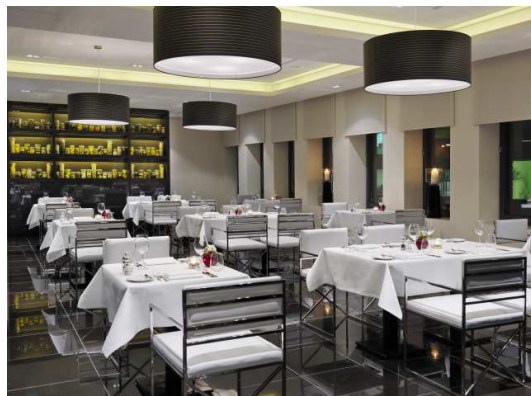
Restaurant „Salt & Pepper“

Our restaurant “Salt & Pepper” with a mix of delicate Mediterranean and international food, our bar at the lobby, our business centre and an underground garage complete our offer. Our charming typical Berlin terrace is perfectly suited for smaller events.