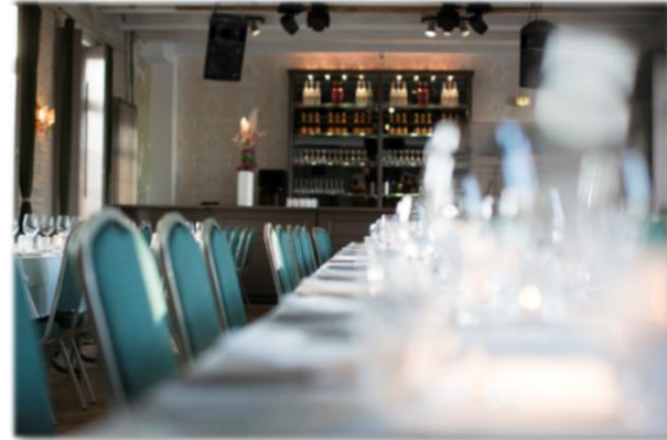
Ballroom - Dinner

The set-up is completely variable and will be customized for each event.