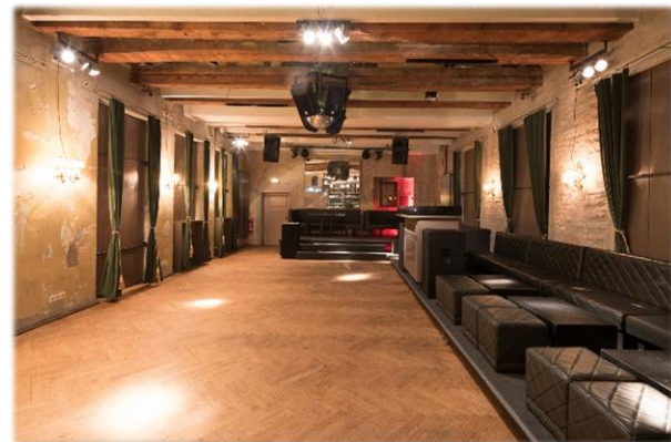
Ballroom - Party