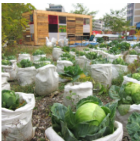
visitBerlin , Foto: GoArt! © Berlin