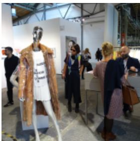
visitBerlin , Foto: GoArt! © Berlin